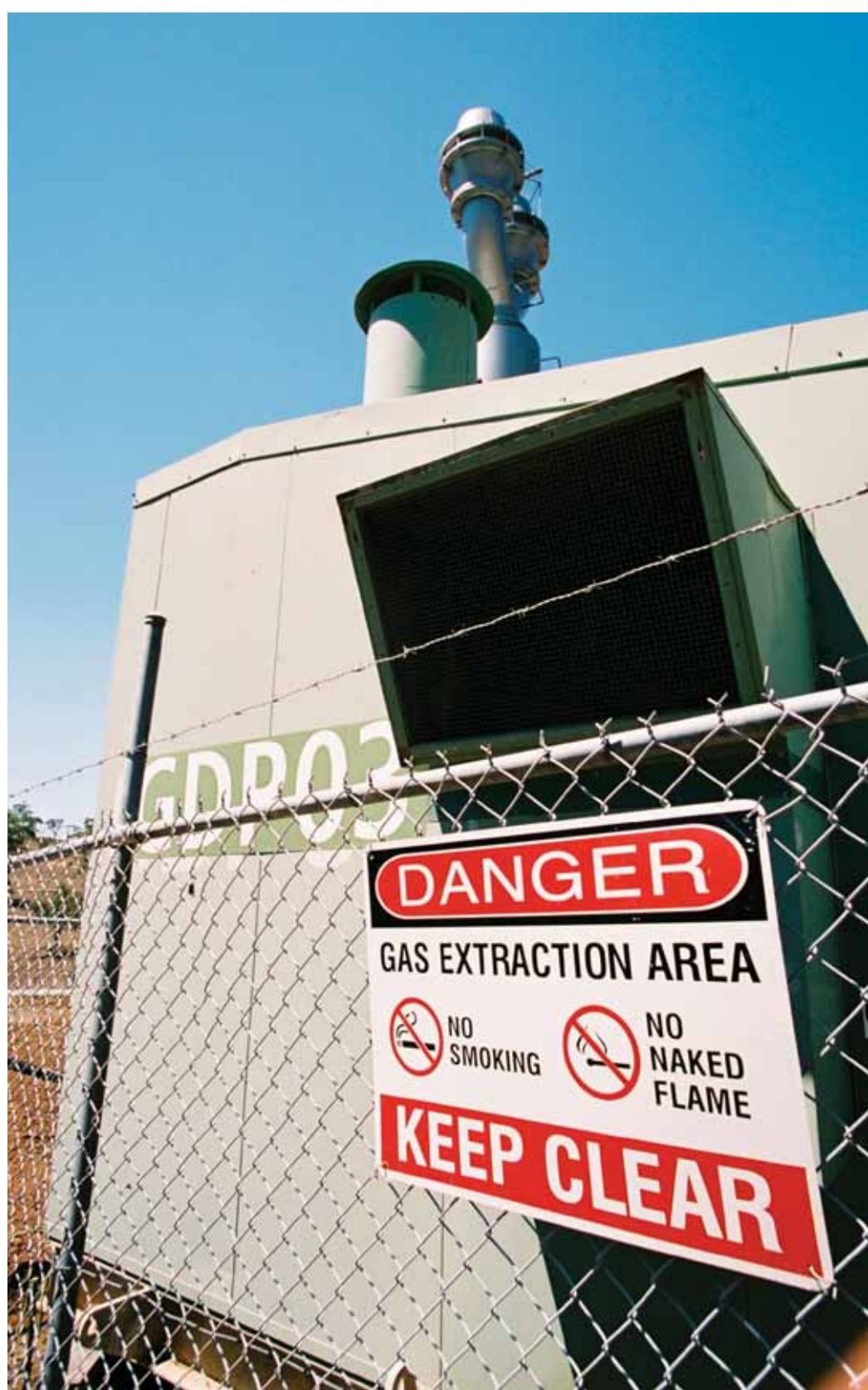
Above: Infrastructure for the methane flaring trial.